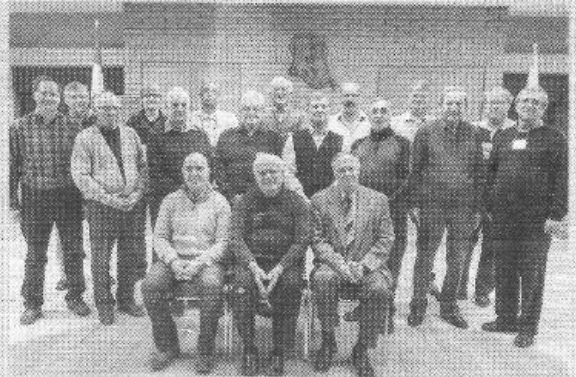
Charter Members of the Our Lady of the Most Holy Rosary Council

The Council has been busy planning its service program. In October, they held a bottle drive to benefit the Ontario Special Olympics. Plans are underway for the Turkey Roll fund raiser which will be held on Friday, November 28 at Holy Rosary School Gymnasium.